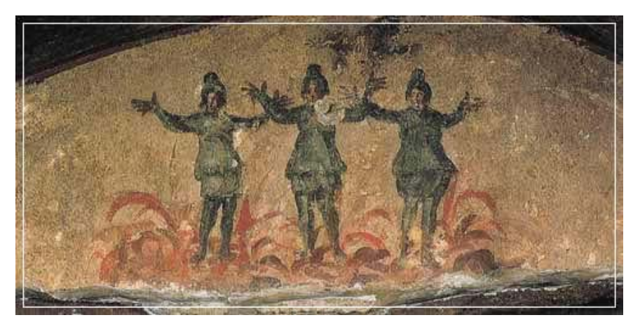
Thursday 19 February 2009 at 5pm

"Sacrifice and Martyrdom in the Roman Empire"