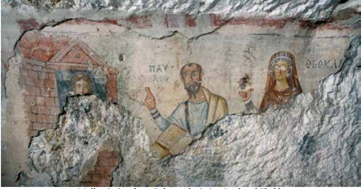
Wall painting from Ephesos depicting Paul and Thekla