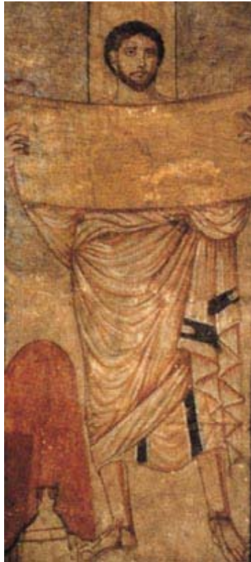
Dura Europos synagogue: the prophet Esra

(With the Seminar for Late Antique and Byzantine Studies)