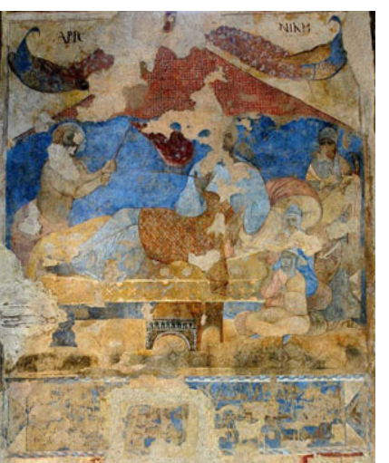
Ousavr 'Amra, cleaned wall-painting

Attendance at this colloquium is free, but space is limited. It is therefore essential to register by writing to administrator@ertegun.ox.ac.uk