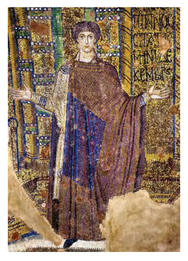
Tuesday 18 October 2016 (2nd Week) at 5pm