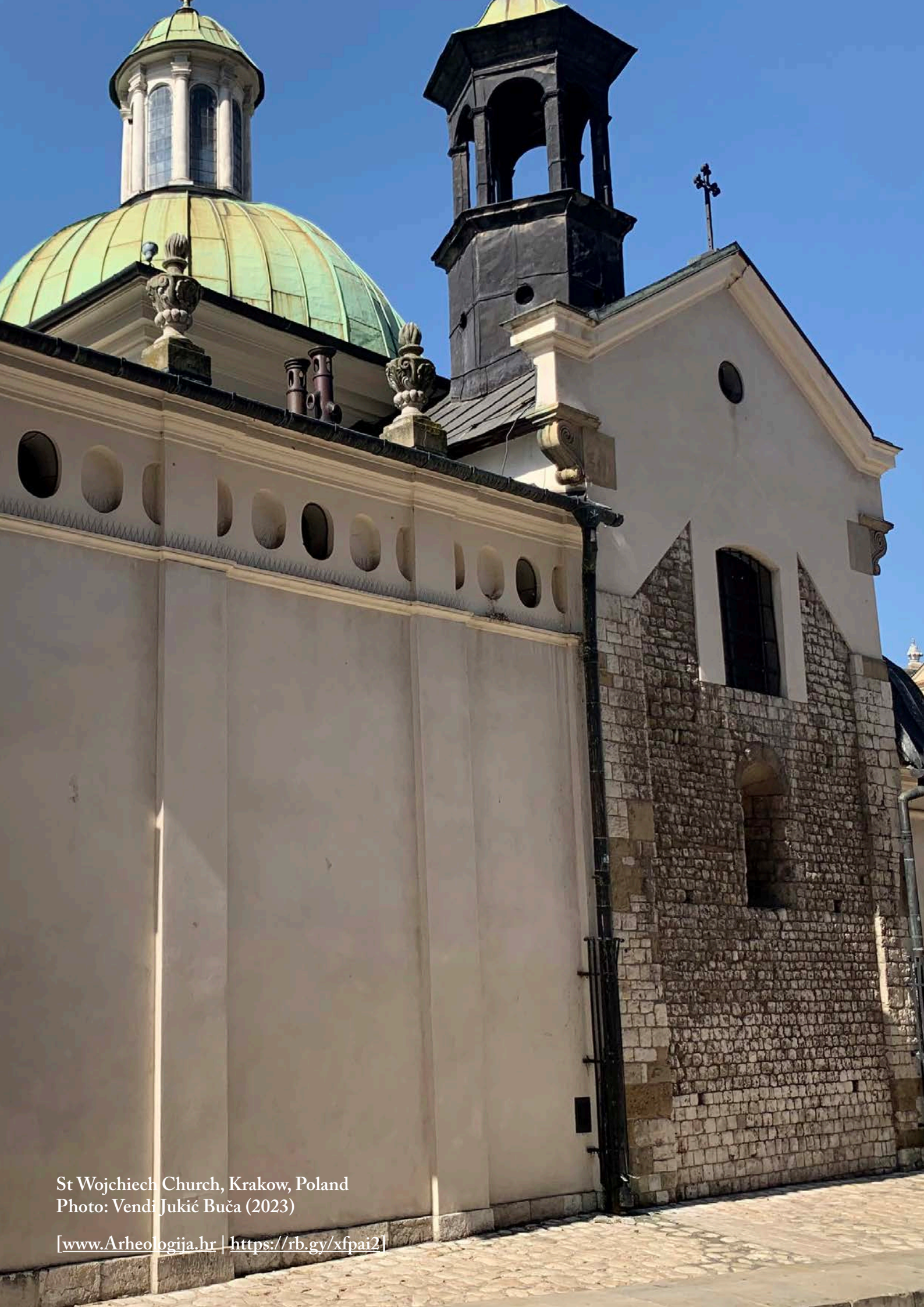
St Wojciech Church, Krakow, Poland Photo: Vendi Jukić Buča (2023)

[ www.Arheologija.hr | https://rb.gy/xfpai2 ]